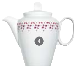
3 421295 Camille 5 4 421292 Camille 2 Nur erhältlich auf Untere.; Only available on saucers; Uniquement disponible sur les soucoupes; Solo en los platitos.; Solo disponibile su piattini;