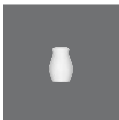
Salzstreuer , Salt shaker, Salière, Salero, Spargi sale

> Salzstreuer 55 4010 5528 - 47 (1.85) 69 60