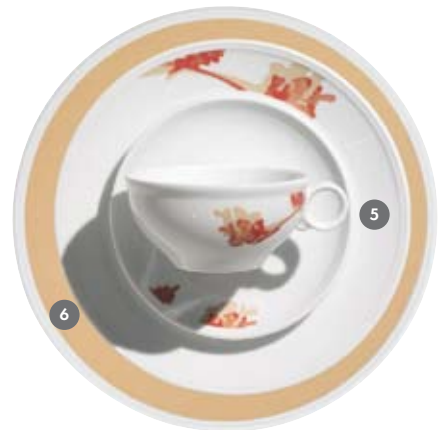
5 421312 Lauraine* 6 421311 Lauraine Fahnenfond

6 Auf Teller flach + tief steile Fahne, Untere.; All plates flat + deep steep rim, saucer.; Aile décorée: toutes les assiettes plates et creuses, soucoupes.; En platos y ala inclinadas, platitos.; Tutti i piatti piani e fondi con falda alta, piattini: 28 6918, 28 6935